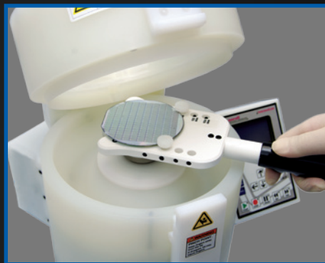
Wafer Alignment Tool Shown

Our exclusive Back-Pack design allows you to add features such as automatic dispense, or Edge Bead Removal on site, without returning your system to the factory!